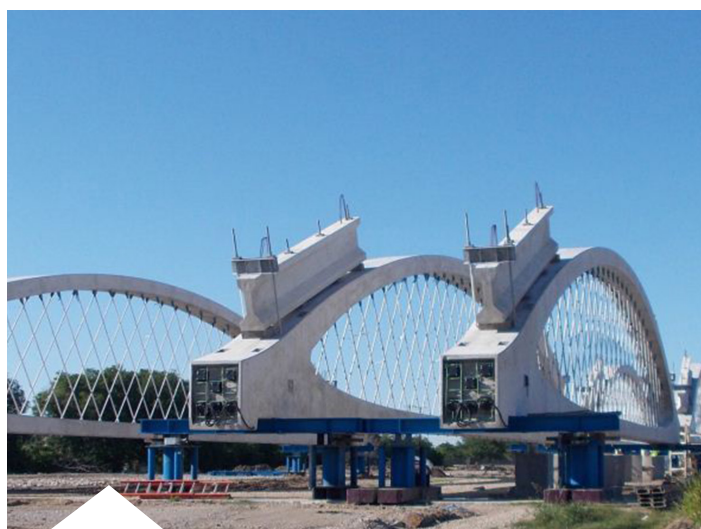
Custom steel pre-cast arch forms.