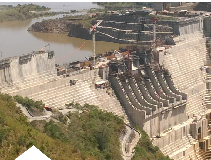
Climbing forms used in the construction of the massive concrete gravity dam on the American River of Northern California.