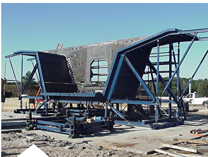
Pre-cast, segmental, short line casting machine designed for robust and speedy segmental bridge construction.