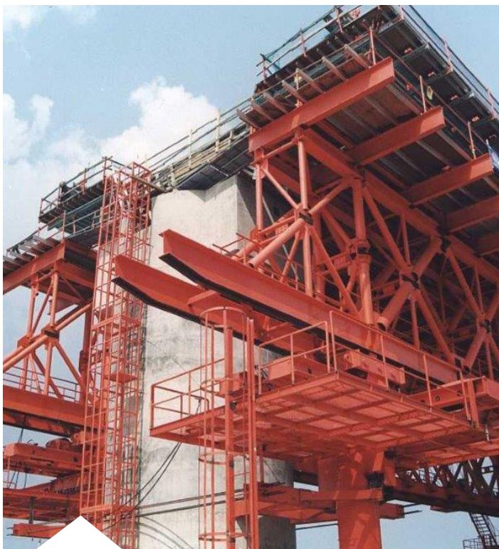
Custom, cantilever formwork & traveler system.