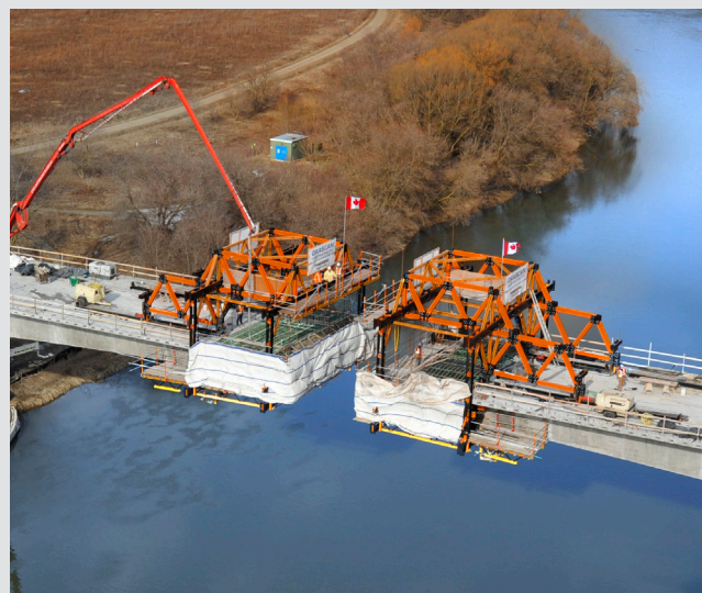
Custom, cast-in-place, balanced cantilever formwork & traveler system.