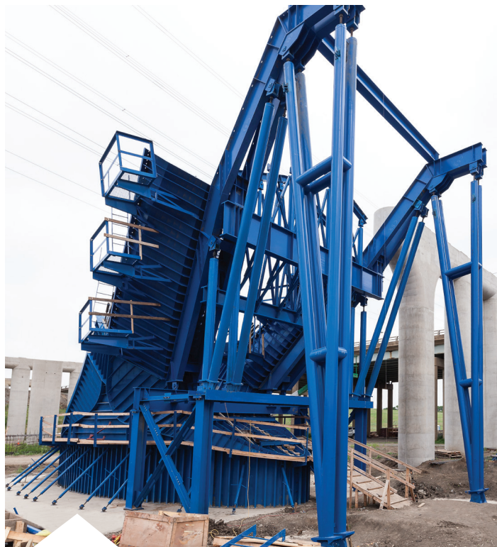
State-of-the-art 3D modeling solution that address both hyperbolic and radial variances