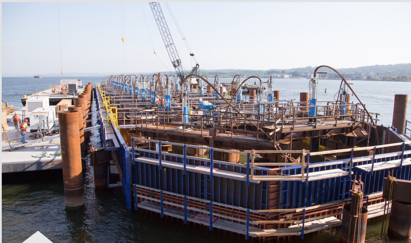
Combination water-tight coffer dam/pylon footing form.