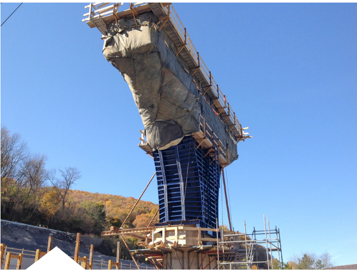
HP Long Bridge: Custom steel pier forms and flares on site in New Orleans, LA.