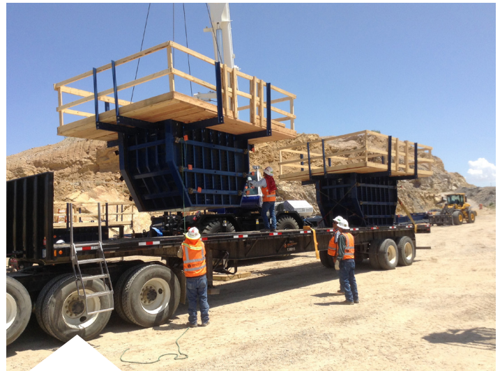
Pier Caps assembled off site and shipped to the project site.