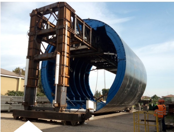
Custom hydraulic actuated tunnel forming system.