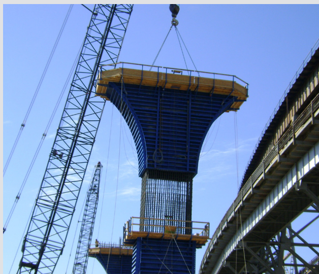
Various shapes and sizes for all heavy civil applications.