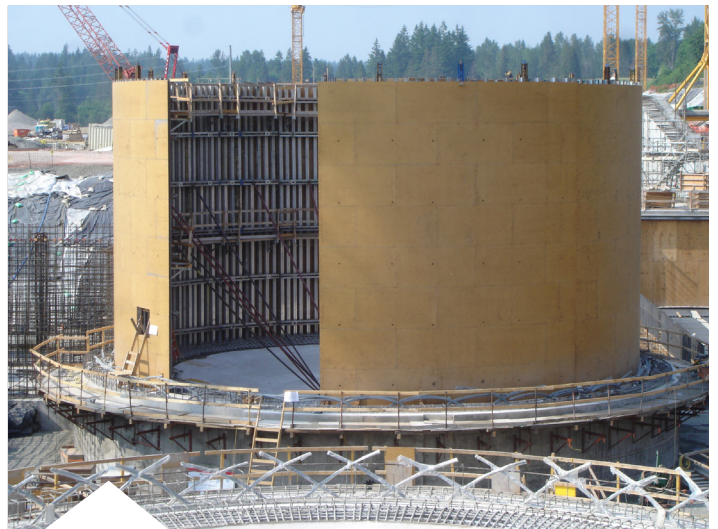
Radius form used in deep water diversion structure.